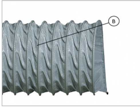
Flame retardant PVC coated polyester fabric

Please contact our offices for not listed sizes