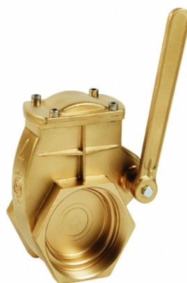
Brass gate valve with lever handle