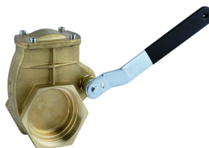
Brass gate valve with steel handle