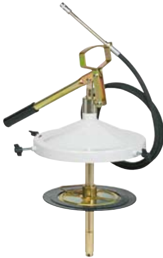
Art. 0A14280 (da ø 240 a ø 260)

Hand-operated portable grease pump for drums, lever-operated, enables practical and safe greasing anywhere and on any motor vehicle or machinery. Particularly suitable for carrying even on the rough ground typical of agriculture or in building sites.