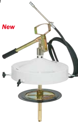
Art. 0A14311 (da ø 270 a ø 330)