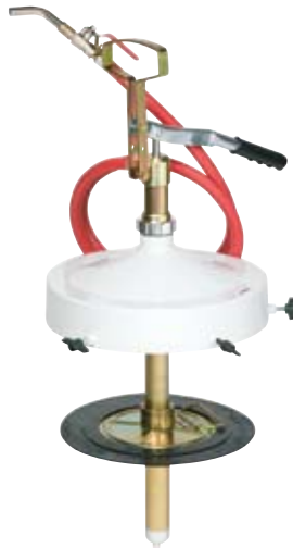
Art. 0A14411 (da ø 270 a ø 330)