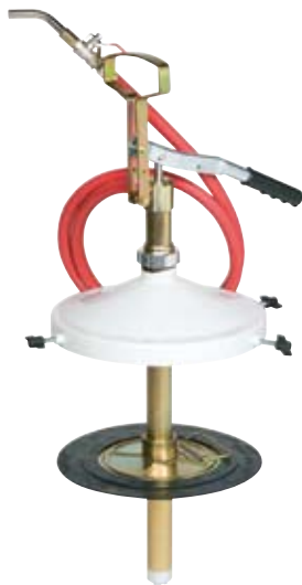
Art. 0A14410 (da ø 255 a ø 300)