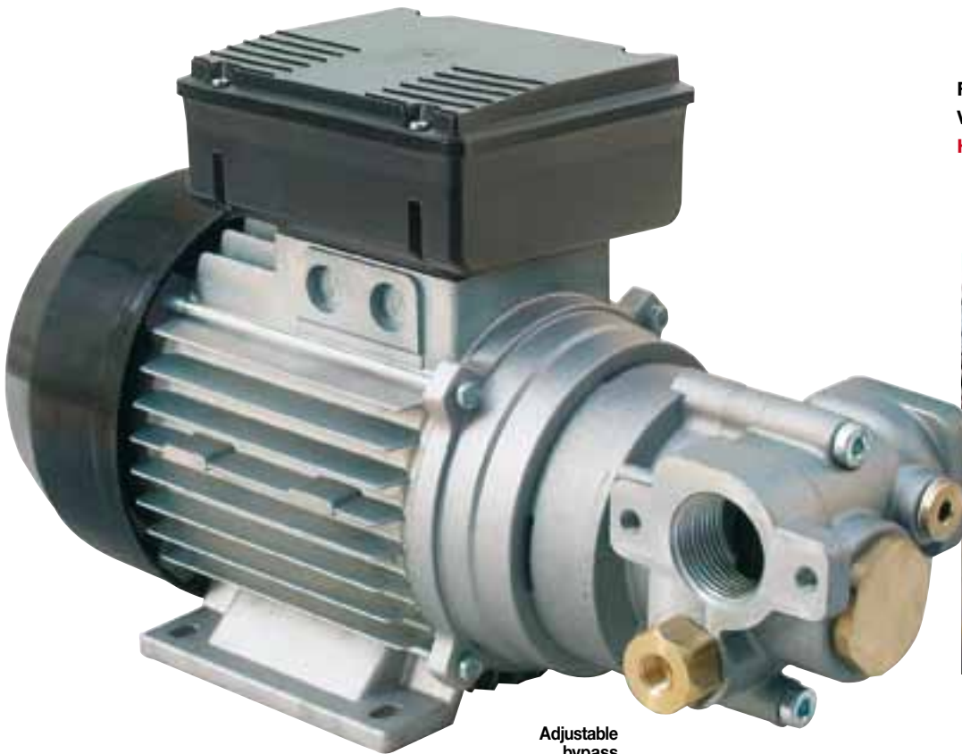
Adjustable bypass valve

Flow rate up to 14 l/min Viscosity up to 2000 cSt High pressure