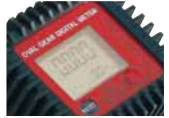
Multifunction display. 5 digit partial. Total. Resettable total and calibration available. Low battery icon.

Electronic card with microprocessor for managing card functions. LCD with 5 figure readings of partial deliveries (height 11.5 mm) and 8 figure readings of total deliveries, without resetting (height 5 mm). Battery powered meters: n. 2 size N batteries Nozzle with: trigger protection to prevent accidental operations. Input with rotating 1" Gas (NPT) attachment. Balanced valve to reduce trigger pressure. Rigid or flexible end with manual non drip valve.