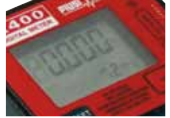
Multifunction display. 5 digit partial. Total. Resettable total and calibration available. Low battery icon.

Rigid or flexible end with manual non drip valve.