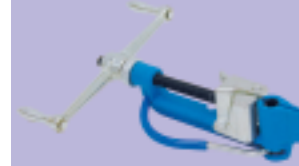
C00169 BAND-IT® Tool