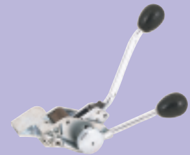
C08569 Bantam Strapping Tool