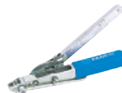
J02069 Pok-It II Tool with Cutter