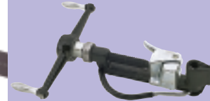
C00369 BAND-IT® Heavy Duty Tool