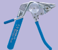
C07569 Bantam Tool