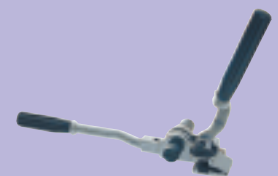
C40099 Ratchet Tool