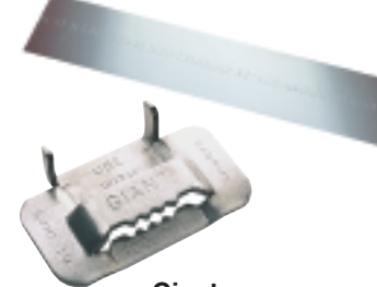
Giant Ear-Lokt Buckle